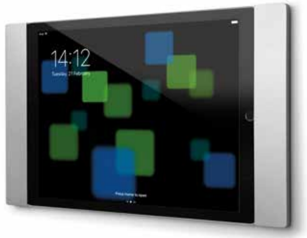
Illustration with iPad Pro